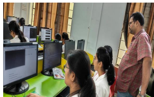
Facilitators Mentoring in Installation of CVAT Tool