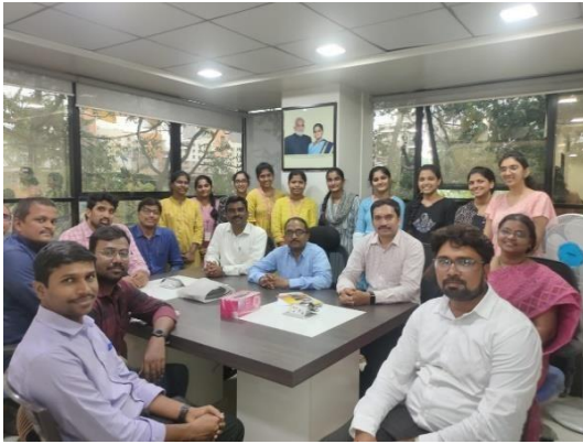
Students Visited ARAI, Pune (16.03.2024)