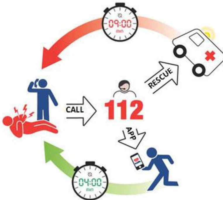
First responder app application procedure