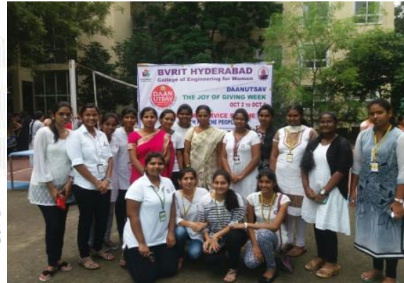
NSS student volunteers for Daanotsav Program