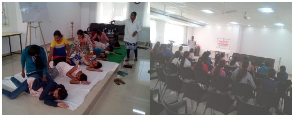
Session on first –aid training program