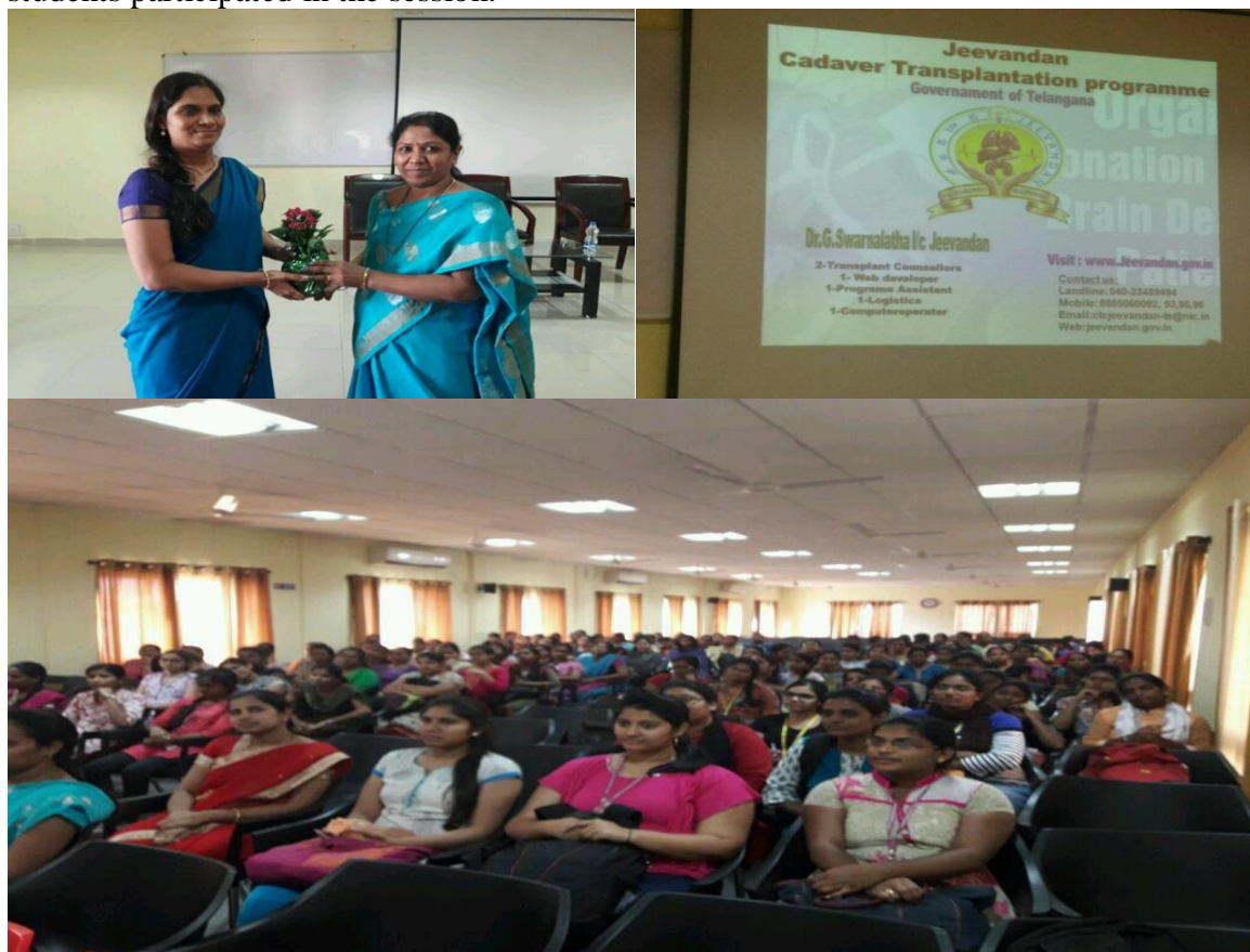
Session on “Organ Donation & Jeevandan” Programme