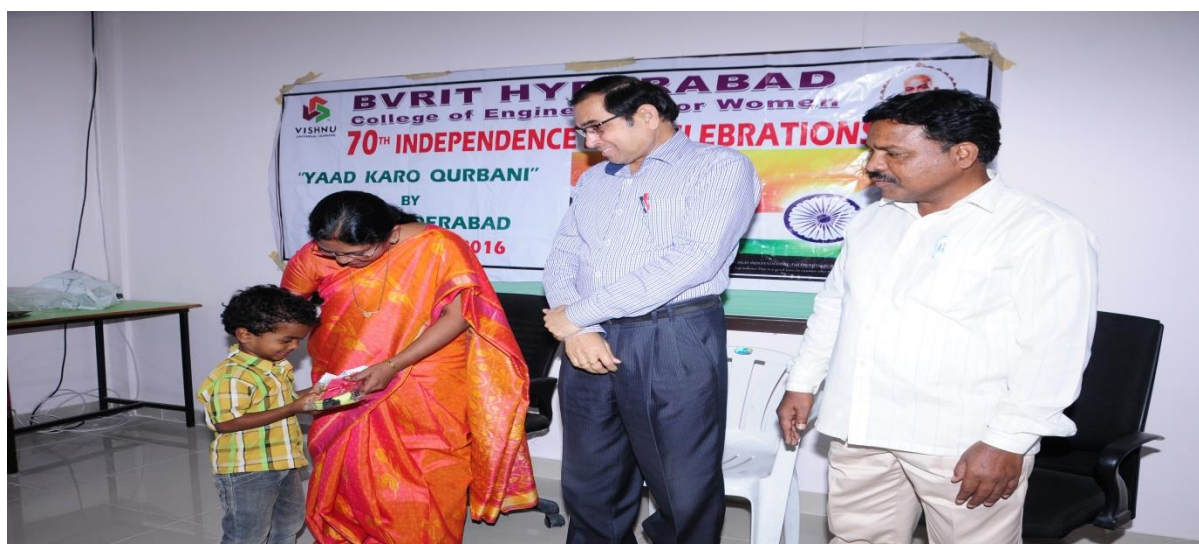
70 th Independence Day celebrations

Brief Report of the Event: August 15 is a significant day and a proud moment for all Indians. On the 70 th Independence Day, a Parade was organized by NSS team of BVRIT Hyderabad. The celebration was inaugurated with a flag hoisting by principal followed by national anthem. Principal and HODs of various departments addressed the students with their inspirational messages. We follow the quote “ You must be the change you want to see in the World ”. NSS volunteers sang patriotic songs praising our country.