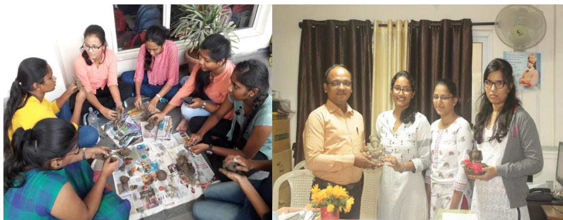
Distribution of clay ganesh idols to BVRITH Faculty

Volunteers of the NSS BVRITH distributed Clay Ganesha idols to BVRITH Faculty and the residents of Rajiv Gandhi Nagar, Bachupally here on 3 September 2016, urging people to celebrate Ganesh Chaturthi festival in harmony with the environment. The NSS volunteers raised slogans explaining the ill effects of using idols made from Plaster of Paris and its dangers to the lakes. Students were seen beating drums rhythmically along the rally by displaying placards and colourful posters. The main theme of this event was to create awareness about pollution caused by using idols made of Plaster of Paris on Ganesh Chaturthi. Around 300+ idols were made with the processed clay and distributed. The Principal of BVRITH, NSS Coordinator, NSS volunteers and faculty of BVRITH participated in this programme with great enthusiasm.