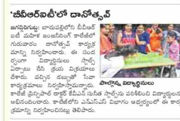
News paper clipping about Daanotsav Program;