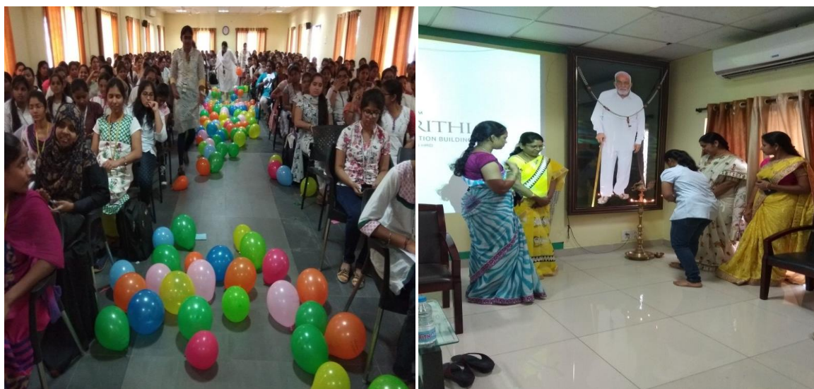
Mitra program conducted by NSS-BVRITH in association with Manojagruthi