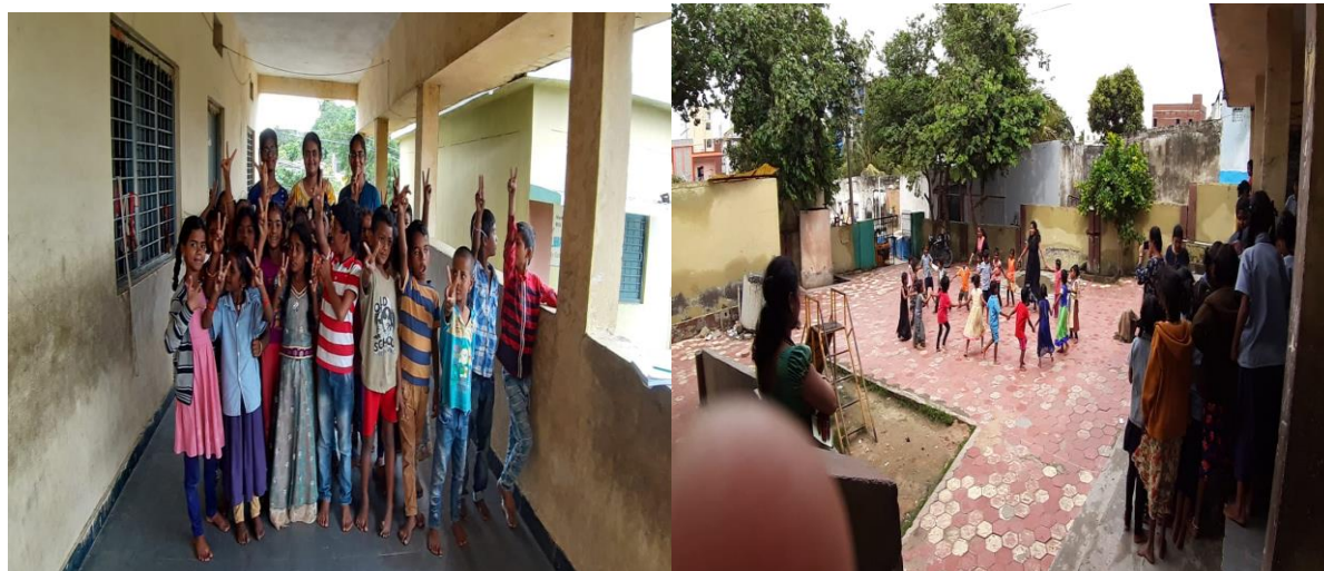
BVRITH-NSS volunteers with Govt school children