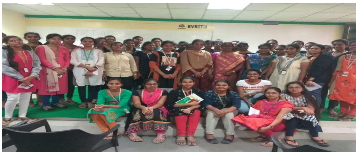
Student participants in First-aid training program