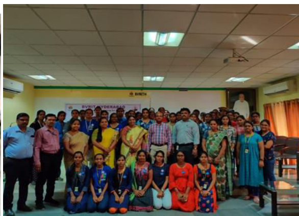
NSS Volunteers with Faculty of BVRITH