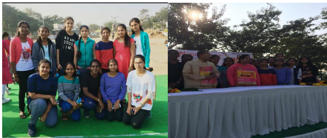
NSS Volunteers Participated in Cancer Marathon