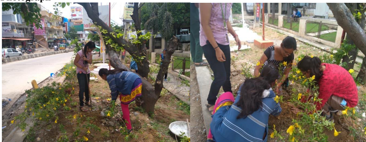
NSS Volunteers of BVRITH participated in Plantation Program