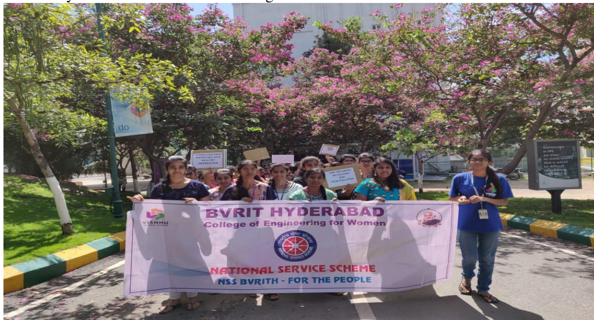
NSS volunteers participated in National Pollution Prevention Day Celebrations

Pollution is a major problem that India is not only facing, but the whole world is battling with it. To create awareness about the effects of pollution, problems that people are facing because of it , NSS BVRITH celebrated National Pollution prevention day on 03-12-2018 at BVRIT Hyderabad Campus. It is very important to manage the Pollution for making the Environment clean and better to live in it. It is very important for people to get every knowledge of the Pollution to reduce it for making a better World of Clean Environment without Pollution. Pollution problem mainly occurs in those areas where there are lots of Vehicles running on the Roads. In this occasion, NSS volunteers request all the students and faculty to use public transport to reduce the private vehicles. BVRITH College management also encourage students to use metro service by providing the free shuttle service to students and faculty from METRO station to college.