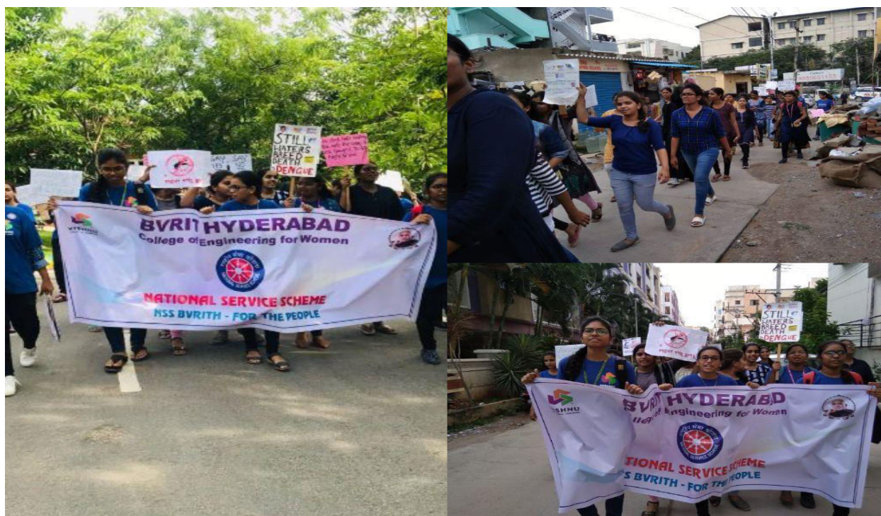
NSS volunteers participated in Dengue Awareness campaign

NSS Volunteers of BVRITH organized an awareness rally on the negative impacts of Dengue. Considering the rise in the number of victims due to dengue and help create a Dengue Free area, Students raised slogans and carried placards on the topic. The rally emphasized to educate the people surrounding Bachuppally on the preventive measures to FIGHT DENGUE through various slogans. Around 40 NSS volunteers, faculty participated in this awareness programme and distributed pamphlets and explained the mode of spread of Dengue virus.