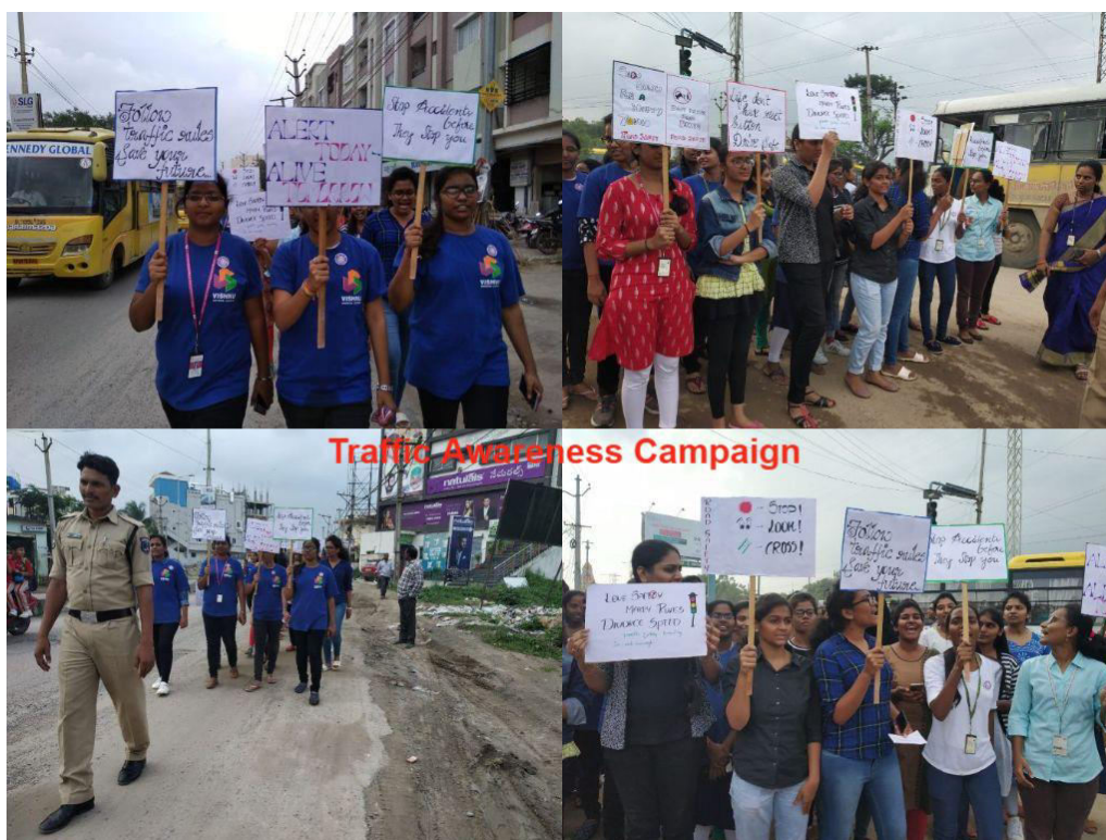
NSS Volunteers participated in Traffic Awareness Campaign