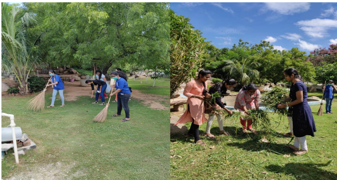
Volunteers participated in Swacch BVRITH campus