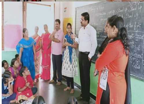
BVRITH NSS volunteers participated in Voice4Girls activities