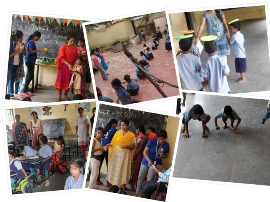
Various programmes conducted for Govt Children on the occasion of Independence day celebrations