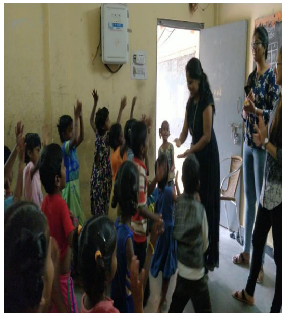
Maths Classes taken by NSS volunteers of BVRITH