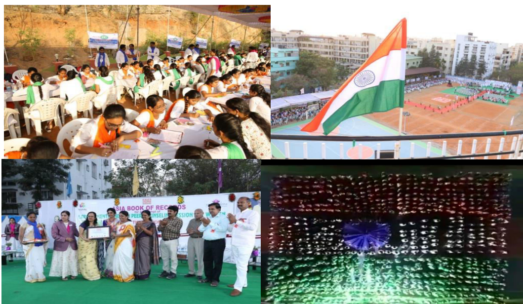
Peer counselling in the part of Asia Book of Records