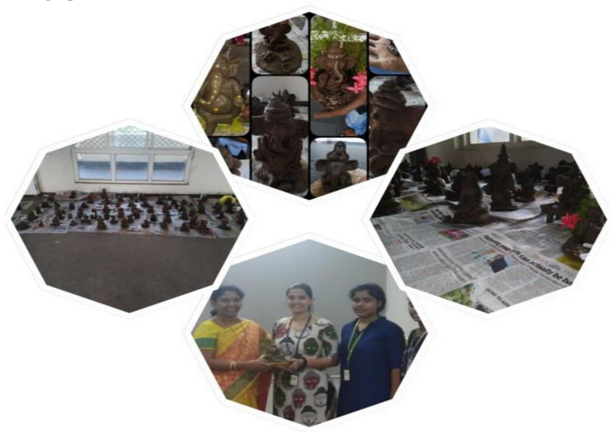
Ganesh Idols distribution by NSS Volunteers