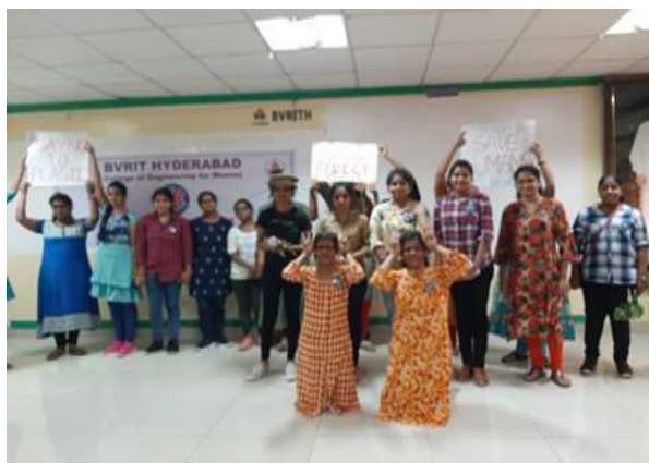
SKIT performance by NSS Volunteers

NSS BVRITH- for the people celebrated the Golden Jubilee of NSS Foundation Day on 24 th September 2018 at 3.00 p.m. in the Seminar Hall, Diamond Block. Students, teaching and non teaching staff participated in the event. NSS was formally launched on 24 th September, 1969, the birth centenary year of the Father of the Nation. Therefore, 24 September is celebrated every year as NSS Day. The Honourable Principal Dr.KVNSunitha, inaugurated the program and spoke about the relevance and significance of NSS in the post-modern scenario. On the occasion, NSS volunteers presented a patriotic song, a skit and also spoke on the present evils in the society. The programs like essay writing competition on plastic waste management, skit on impact of plastic on environment were conducted. The program was enriched by the cultural presentations by the volunteers followed by NSS oath. The students' involvement is truly appreciable.