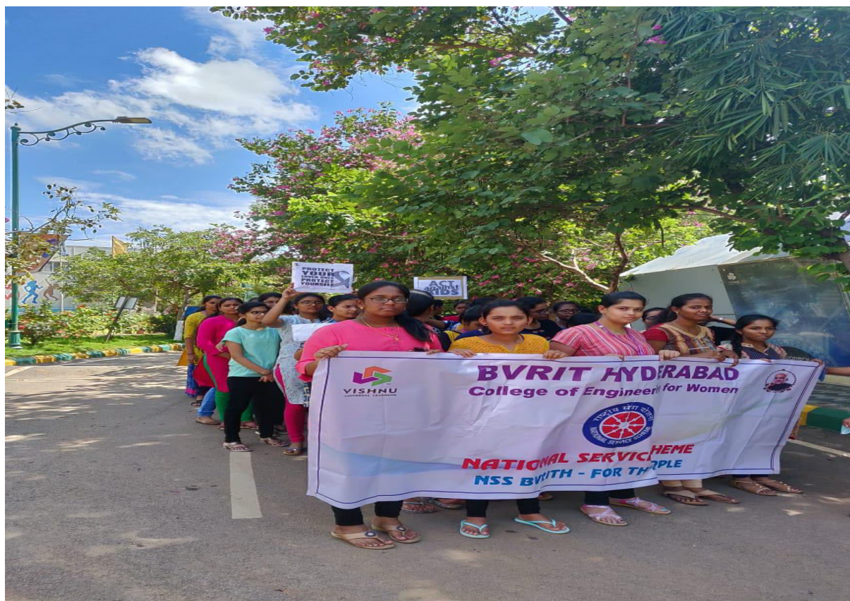
Students participation in AIDS Awareness Campaign program

World Aids Day is observed on December 1 every year to create awareness about the symptoms, causes and preventives of the pandemic disease HIV/AIDS that has taken unprecedented number of lives. Awareness Programme on Prevention of HIV/AIDS was organized by NSS BVRITH-for the people on 01/12/2018 to enlighten people about the signs and symptoms of HIV/AIDS. The students actively participated in spreading awareness by conducting campaigns and rally with slogans and believed that the future generation has the ability to sensitize others and prevent spread of HIV.