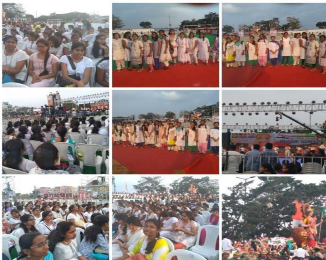
Participated Students of BVRITH in BharathaMathaMahaHarathi Program