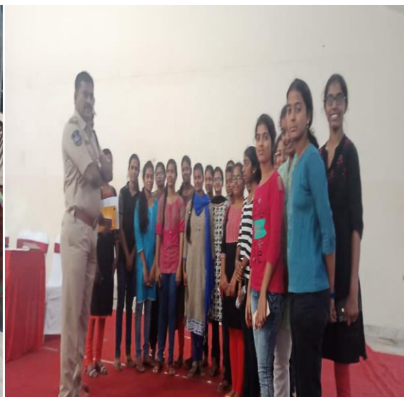
Student Volunteers for 17 th Lok Sabha Elections