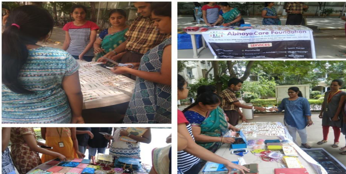
NSS Volunteers selling rakhees made by autistic children