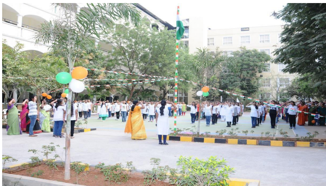
Student participated in 72 nd Independence Day Celebrations