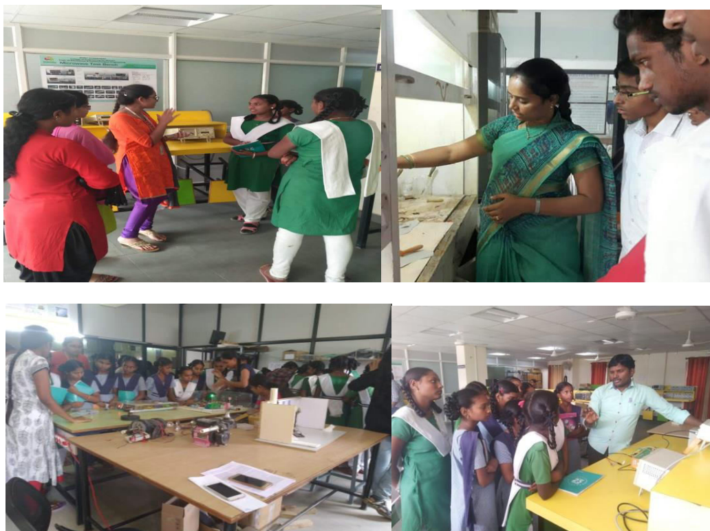
School Children visited BVRITH campus

Self Motivation is always a best motivation. When we explore more about the world, our dreams, aspirations increase and hence we become more and more confident to face this competing world. Field trip is one of the most successful educational trips not only to gain knowledge but also to get the idea of value of higher education. On 02/02/2019 a field trip was organized by SAHAYA wherein students of Govtschool, Shamsheeguda visited BVRITH College of Engg for Women to explore more on how higher education is and the benefits of it. They are even given a chance to visit each and each lab, library, class rooms of colleges, so that they could aspire to pursue higher education. During this, lecturers teach them about the working of regular used machines.