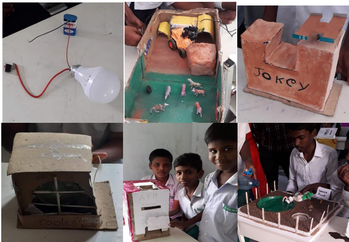
Various projects exhibited in Science Fair

One of the most precious, valuable subjects is Science. We come across Science in our day-to-day life. Almost everything we see is based on Science. All we need to do is just understand the principle behind it. So, Sahaya society in coordination with NSS BVRITH-for the people conducted Science Fair for government school students on 02/03/2019 to bring out their talents in the field of science and to make them aware of practical sciences. Students too showed a keen interest in science fair and put their heart and soul to work on their projects. This is the opportunity to put their theoretical knowledge into practical application. Sahaya society also takes the initiative to provide them all the necessary equipments for their projects. NSS volunteers of BVRITH helped the students to come out students outstanding ideas to practical experiments and the projects made by them were really appreciated.