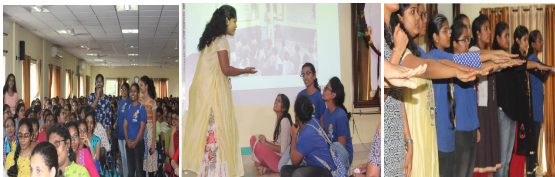
Skit performance by NSS volunteers