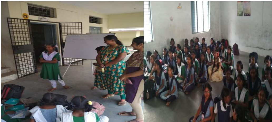
NSS Volunteers of BVRITH participated in Mental Health Awareness program

Mental health awareness is an important issue for all educators. Student's mental health has great impact on learning and achievement. Considering the importance of mental health, certified NSS volunteers of BVRITH (MITRAs) help Govt school students with mental issues to promote healthy social, emotional, and behavioural development of students. The concepts of self-care and responsibility, negative coping behaviours, as well as the negative impact were emphasized towards mental wellness.