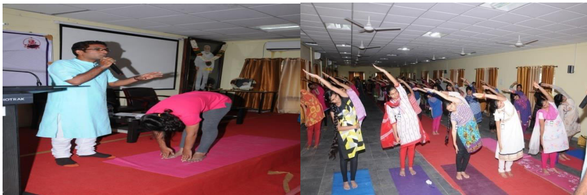
BVRITH students participated in International Yoga Day Celebrations