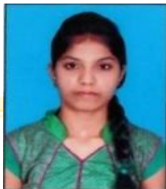
A Supraja (7.83) 16WH1A0202