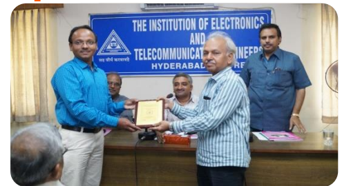
Department of ECE, BVRIT Hyderabad received 3rd BEST IETE Award for the year 2013-14 from IETE Hyderabad Chapter