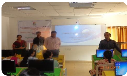
Two day workshop on PCB Designing and Fabrication in association with Indo Global Services on 23rd & 24th December 2013.