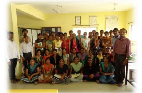
Two day workshop on Mobile Testing and Repair in association with SS Mobiles Training Institute on 26th & 27th July 2013 under Engineering Clinic