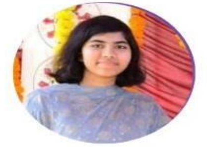
MC-1, TM Gnanika

Highlights-- Memes, Ice breaker, Panel discussion, Cake cutting